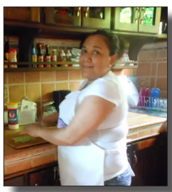
Chelo - Bon Appetite