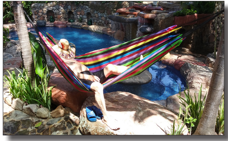
Relax - Relajate